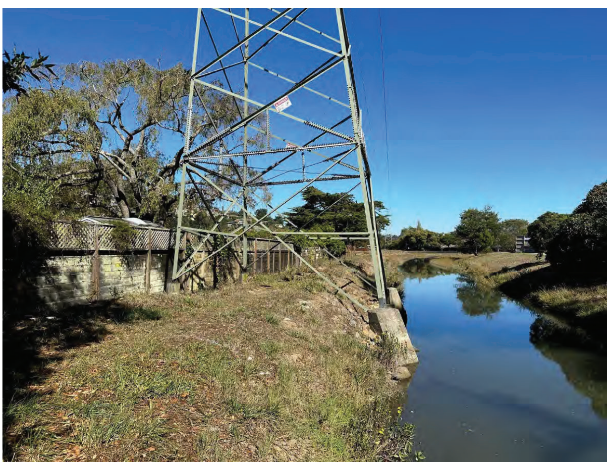
Photograph 2: Preconstruction Photo- Footings of existing Tower 013/094 with channel to the right looking downstream, taken October 18, 2023, facing north.