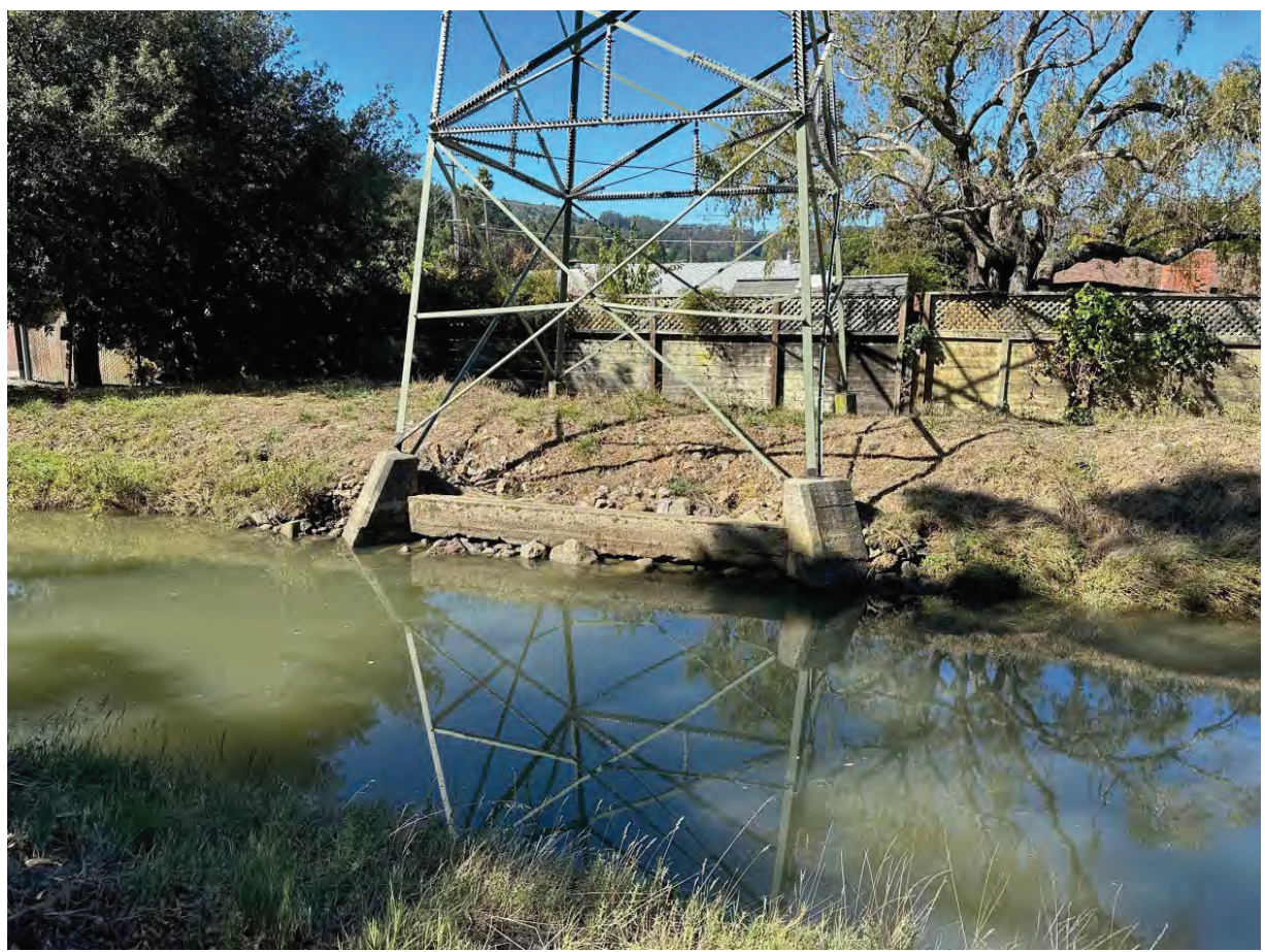
Photograph 1: Preconstruction Photo- Portions of the concrete footings of Tower 013/094 that extend into the mean high-water line of the channel, taken October 18, 2023, facing west.